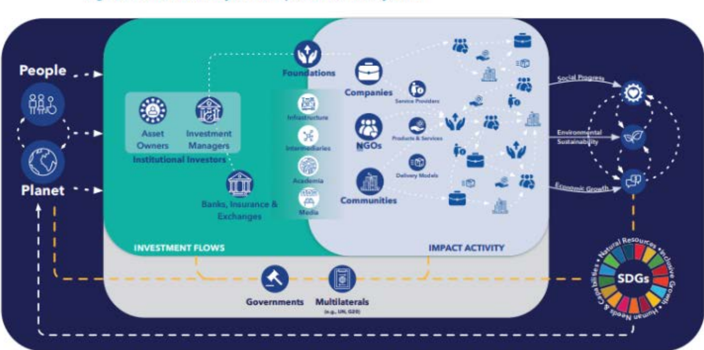
Figure I.1: Vision for a dynamic impact-driven ecosystem